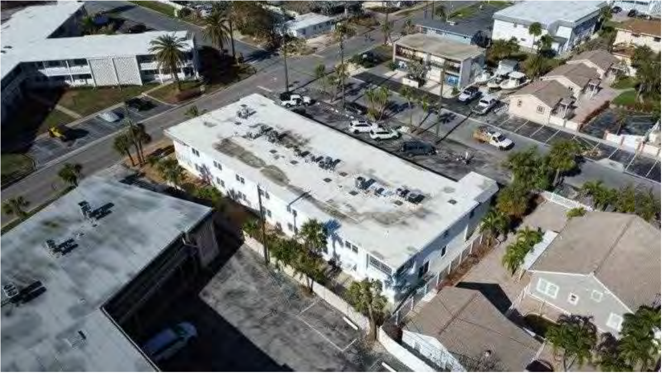
Aerial View of Property