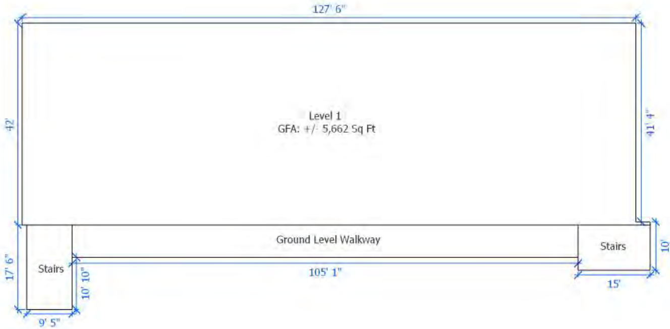
Level 1 of 2